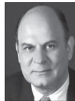
Liaquat Ahamed (Born 1952) Trustee since 2012

Mr. Ahamed is the Pulitzer Prize-winning author of Lords of Finance: The Bankers Who Broke the World . His articles on economics have appeared in the New York Times, Foreign Affairs, and the Financial Times.